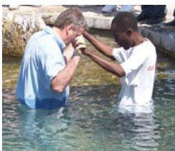
Preparing for baptismal

SO, if you know anyone who feels called to the mission field, encourage them through prayer to consider filling this role here in Haiti. Medical experience is helpful but not limited to doctor's or nurses (Pharmacists, Pharmacy techs, etc.) please contact CSI in Muncie.