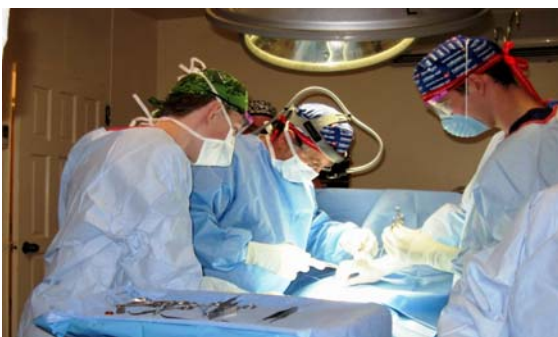
Left: Blue Chip Surgical